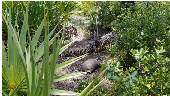
Photo: A gopher tortoise in habitat at Jonathan Dickinson State Park,

restoration is imperative to stop the extinction crisis, respond to climate change, and deliver essential ecosystem services like clean water and breathable air. But imagine a world in which any ecosystem restored or being restored can be destroyed with the stroke of a pen because it is not ‘unspoiled’. Are the Everglades next?