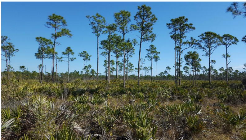
Globally Imperiled Florida Scrub at Jonathan Dickinson State Park

Is it 1984 or have I lost my mind? The great Jonathan Dickinson controversy.