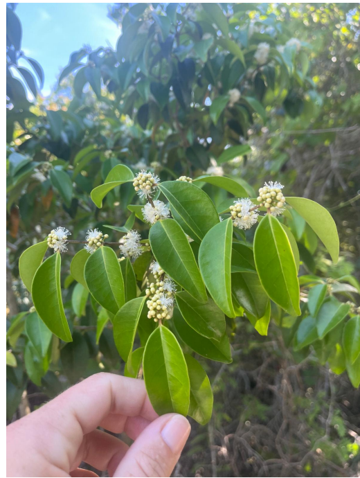
White stopper ( Eugenia axillaris )

IRC has an E-Trade account. Please contact us about giving gifts of stock.