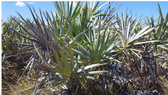
Photo: Saw palmetto in scrub habitat