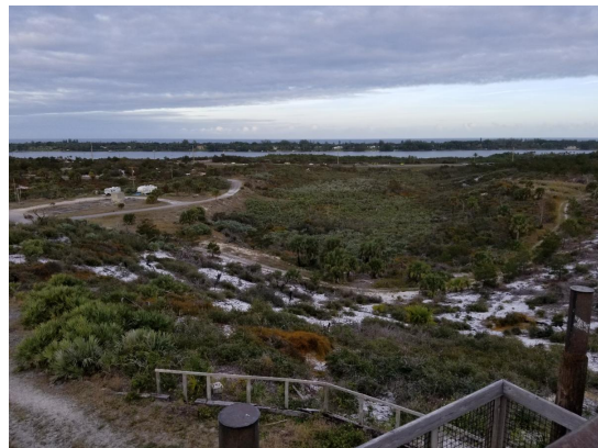
Photo: Arial photo looking east from the Hobe Mountain Observation Tower

One of the eight globally agreed principles of ecological restoration is Ecological Restoration Supports Ecosystem Recovery Processes (Gann et al. 2019). Nature, assisted by appropriate restoration measures, can be highly effective at recovery – in fact Nature is way more efficient than we are. Yes, there were many buildings in the past where scrub is now at Jonathan Dickinson. This is not something negative, but rather a testament to the power of Nature and the good works of the Florida Park Service. This recovery is an incredible success story to be celebrated, not something to be diminished to sell off another piece of Florida to the politically connected.